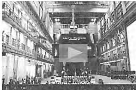
MADE IN ALASKA: The christening of the F/V Arctic Prowler in Ketchikan. Built for an Alaskan workforce, by an Alaskan workforce, right here in Alaska.