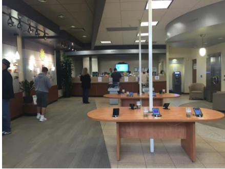
ALASKA DEPARTMENT OF COMMERCE, COMMUNITY, AND ECONOMIC DEVELOPMENT 10