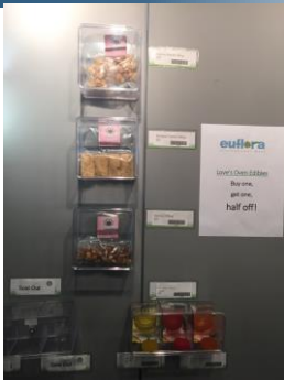
ALASKA DEPARTMENT OF COMMERCE, COMMUNITY, AND ECONOMIC DEVELOPMENT 12